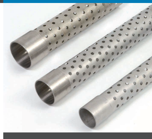
Tubular carriers for bottles